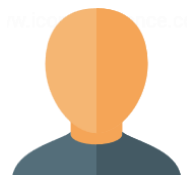
Portrait – Correct