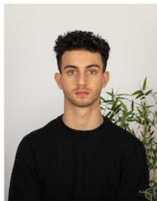
✗ Object in background