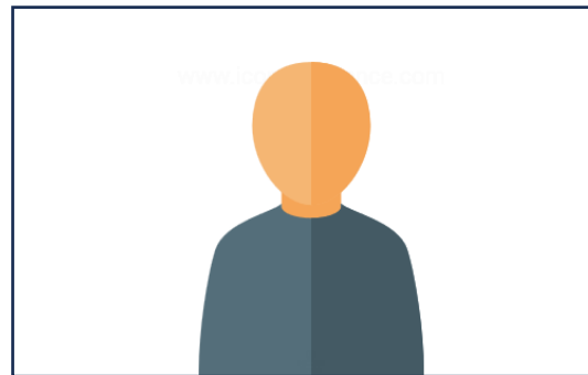
Too much background and body – Incorrect