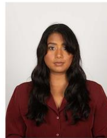
✗ Hair covering eyes