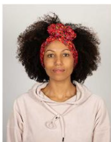
✗ Fashion hair accessories