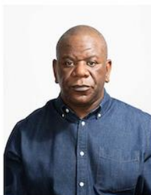
✗ Shadow on face