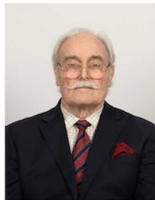
✗ Glasses covering eyes