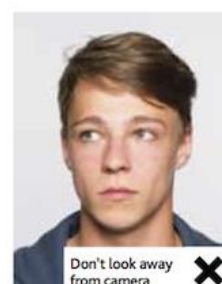
Don't look away from camera ✗