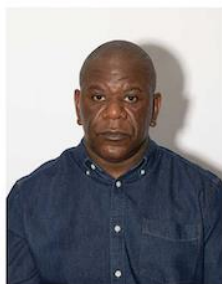
✗ Shadow behind head