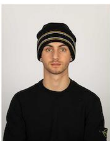
✗ Fashion headwear