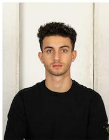
✗ Textured background

Below are examples of unacceptable photographs ( adapted from the gov.uk website ):