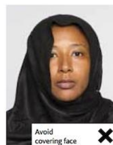
Avoid covering face ✗