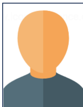
Cropped to clearly show head and shoulder only - Correct