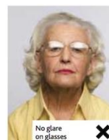
No glare on glasses ✗