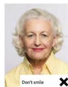
Don't smile ✗