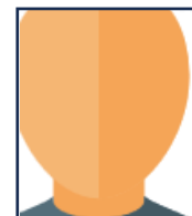
Cropped too close – Incorrect