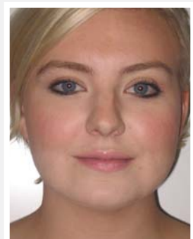
X too close