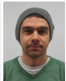
X no hats