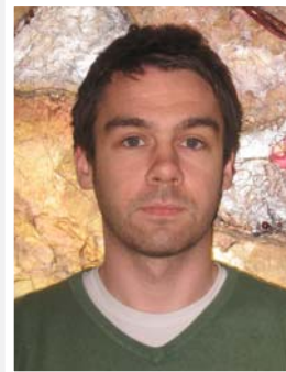
X background too busy

Please note that photographs become part of our official records and we will not return them.