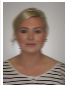
X picture blurred