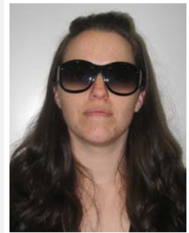
X no sunglasses