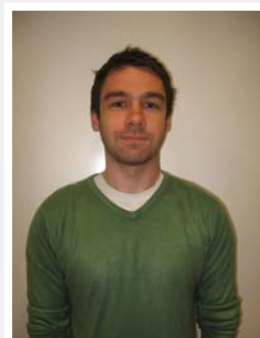
X too far away