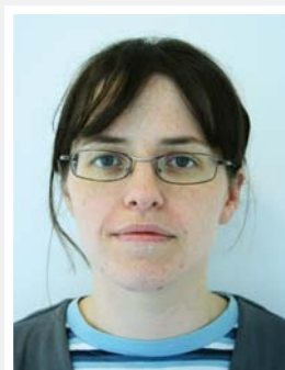
✓ correct photo